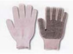
Art No. PVC/1002 Poly/Cotton size : 6 to 10