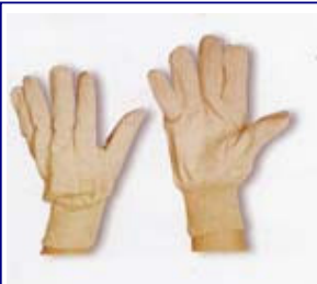
Art No. AB/202 Drill Fabric of 8 OZ with knitted wrist size : 6 to 10