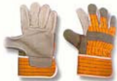
Art No. L-011 Combined Canadian glove with rubberised cuff, Y/B Textile