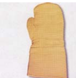
Art No. KYW/ALU/21 Aluminised Aramid with PBI Temp. upto 600° -900° size : 30 to 42 cm