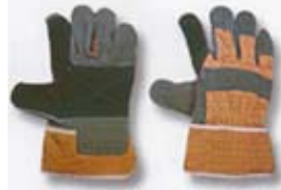
Art No. L-005 Split Canadian glove with Reinforcement of coloured Split up to show Finger criss-cross Stitch on palms canvas Textile