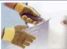
Art No. PVC/D/KY/05 PVC dots on both side Kevlar® Gloves