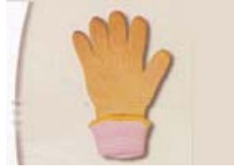
Art No. KYD/11 Kevlar® with cotton liner size : 26 to 42 cm