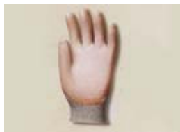
Art No. CON/PU/711 PU-Coated Conductive Glove (Anti Statics) size : Free