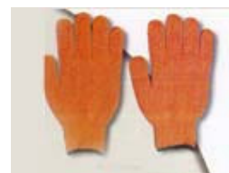
Art No. IO/OR/I Poly/Cotton size : 6 to 10 Colour : Gray/ Brown/ Orange