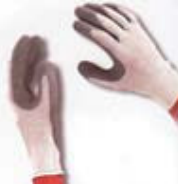
Art No. DY/PU/730 Dyneema® with PU-Coating size : 7 to 10