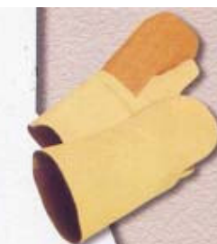
Art No. KYD/ALU/22 Aramid with Aluminised Fabric Temp. 400° C - 550° C size : 30 to 42 cm