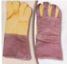
Art No. KYW/HRL/2 Aramid/Heat resistant leather Temp. upto 450° C size : 30 to 42 cm