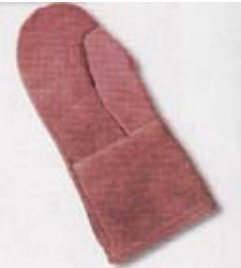
Art No. HRL/2/Mitten Heat resistant leather Temp. upto 250° C size : 30 to 42 cm