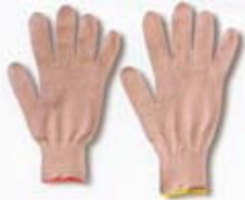
Art No. A/103 100% Cotton Wt : Light/ Medium/Heavy size : 6 to 10