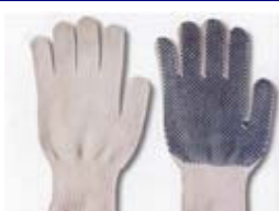
Art No. PVC/142 100% Nylon size : 6 to 10