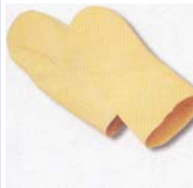
Art No. KY/Felt/D1 Made of Aramid Felt Temp. 200 - 300° C size : 30 to 42 cm