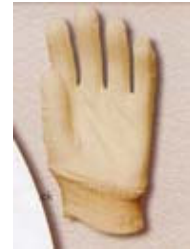
Art No. A/106 100% Cotton Interlock with knitted wrist size : 6 to 10