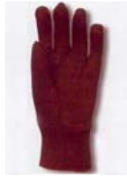
Art No. A/120 100% Cotton Brown Jersey 8 OZ with knitted wrist size : 6 to 10