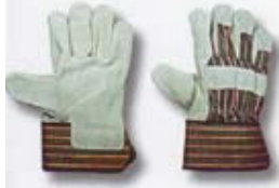
Art No. L-001 Canadian glove made from Normal Split leather with Y/Green Textile