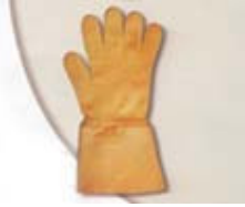
Art No. KYD/11/Felt Kevlar® with cotton liner and Aramid felt cuff size : 30 to 42cm