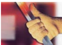
Art No. KY/SPG/11 Terry Kevlar® with cotton liner size : 26 cm