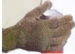
Art No. PON/KY/760 C - Panox/Kevlar® with inside cotton Liner Glove Temp. upto 450° C