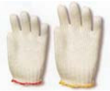
Art No. HTN/740 HT Polyamide (Nylon) size : 6 to 10