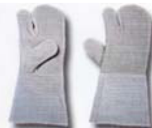
Art No. L-013 3 F. All split welding glove cuff length 15cm, Total length 35