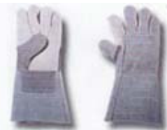
Art No. L-015 5 F. Combined welders with back & thumb of split leather cuff length 15cm, Total length 35 cm.