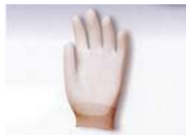
Art No. PU/700 Nylon Glove with PU-Coating size : 6 to 10