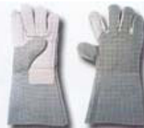
Art No. L-021 Combined fireman glove with Reinforcement up to show finger