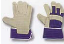
Art No. L-006 White cow grain leather Canadian style glove with Rubberised cuff, Blue Textile