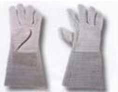
Art No. L-017 5 F. All Grain welding glove cuff length 15 cm. Total length 35 cm