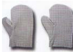
Art No. L-019 Mitten gloves in split leather