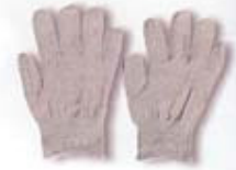
Art No. CON/710 Conductive Glove (Anti Statics) size : Free