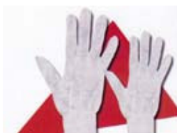
Dyneema® Cut resistant size : 6 to 10