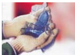
Art No. AS/KY/170 Kevlar®/Cotton Terry Gloves Cut/ Heatresistant upto 200° C