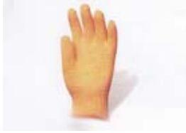
Art No. KY/05 Kevlar® Weight : Light/ Medium/ Heavy size : 26 to 40 cm