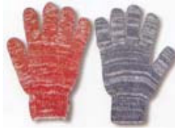
Art No. R/118 & G/118 Poly Cotton Wt : Medium/Heavy