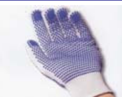
Art No. PVC/D/2001/ COM Poly/Cotton with both side PVC Dots size : 6 to 10