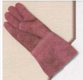
Art No. HRL/2/5F Heat resistant leather Temp. upto 250° C size : 30 to 42 cm