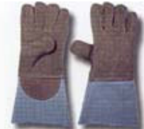
Art No. L-024 Welding glove in camel Brown H/R split leather stiched with kevlar Thread Total length 35 cm. With woolen lining.