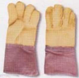
Art No. KYW/HRL/1 Aramid/Heat resistant leather Temp. upto 450° C size : 30 to 42 cm