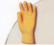
Art No. PVC/KY/03P.V.C dotted Kevlar® size : 6 to 10