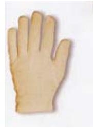
Art No. A/105 100% Cotton Interlock size : 6 to 10