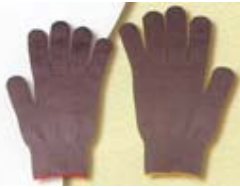
Art No. G/142 100% Nylon (Polyamide) size : 6 to 10