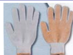
Art No. PVC/2001 Poly/Cotton size : 6 to 10