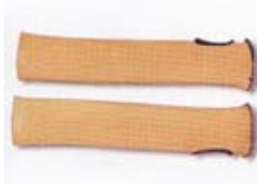
Art No. KY/sleeve Kevlar® knitted sleeve size : 25 to 60cm