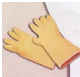
Art No. KYW/ALU/23 Aramid - Aluminised Fabric Temp. 400°C - 550° C size : 30 to 42 cm