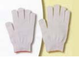
Art No. A/142 100% Nylon (Polyamide) size : 6 to 10