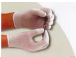
Art No. NBR/721 Nylon Glove with NBR coating size : 6 to 10