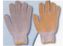
Art No. PVC/103 100% Cotton size : 6 to 10