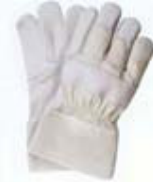
Art No. L-007 White cow grain leather Canadian style glove with Canvas Textile-Hemmed Cuff Double Stitch