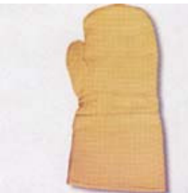
Art No. KYW/600/2 Aramid Temp. upto :650° C size : 30 to 42 cm