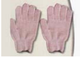
Art No. AS/170 100% Cotton Terry size : 26 to 40 cm Temp. upto 150° C