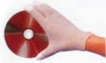
Art No. PU/701 Nylon with PU-Coating size : 6 to 10