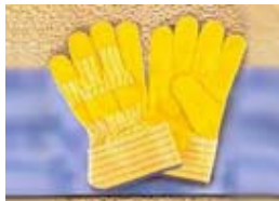
Art No. L-009 Yellow Chrome Canadian glove with Blue Textile