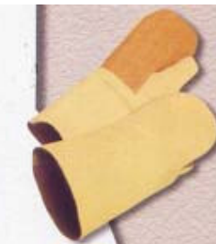
Art No. PBI/KYW/11 Glove made of Aramid/ PBI Fabric Temp : 500 - 700° C size : 30 to 42 cm