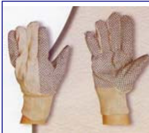
Art No. AC/PVC/201 Drill Fabric Polka Dotts with 6 OZ knitted wrist size : 6 to 10