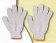
Art No. PC/2001 Poly Cotton Wt : Light/ Medium/Heavy size : 6 to 10