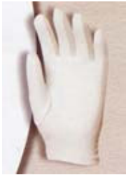
Art No. A/125 Bleached Interlock size : 6 to 10